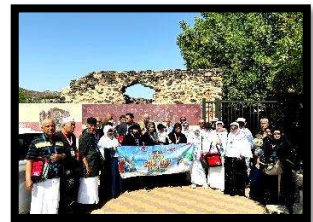
Historic Hudaibiyah Treaty