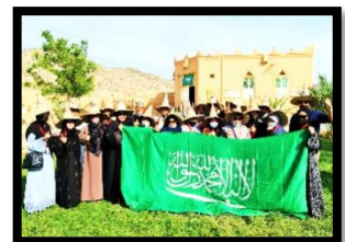
Al Amoudi Museum