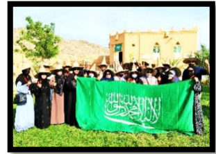
Al Amoudi Museum