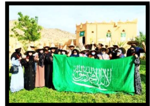
Al Amoudi Museum