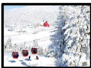
Uludag Mountain Ski Center