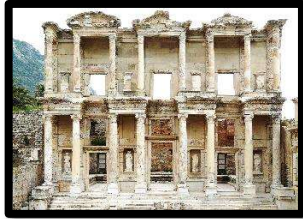
Liberty of Celsus