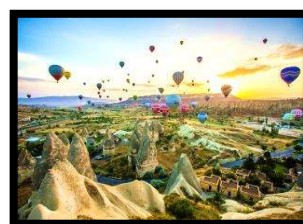
Hot Air Balloon