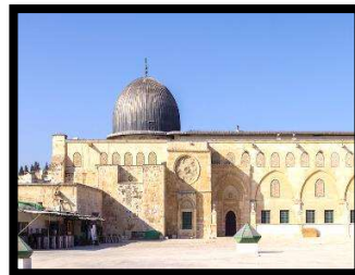
Masjid Al Aqsa