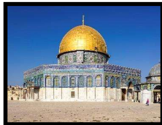
Dome of the Rock