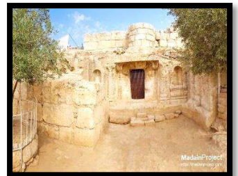
Cave of 7 Sleeper